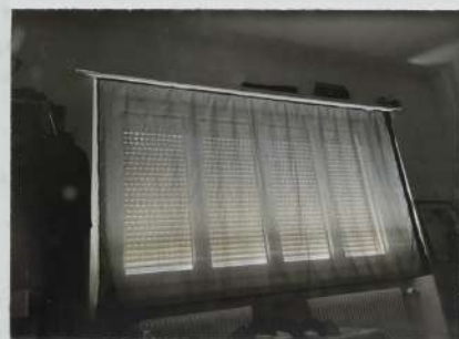
untitled (window 3, Anthony) , 2025 screenboard, inkjet print on semigloss paper, potato starch beads on nylon thread 59.5 x 75.5 cm, Ø 8 cm