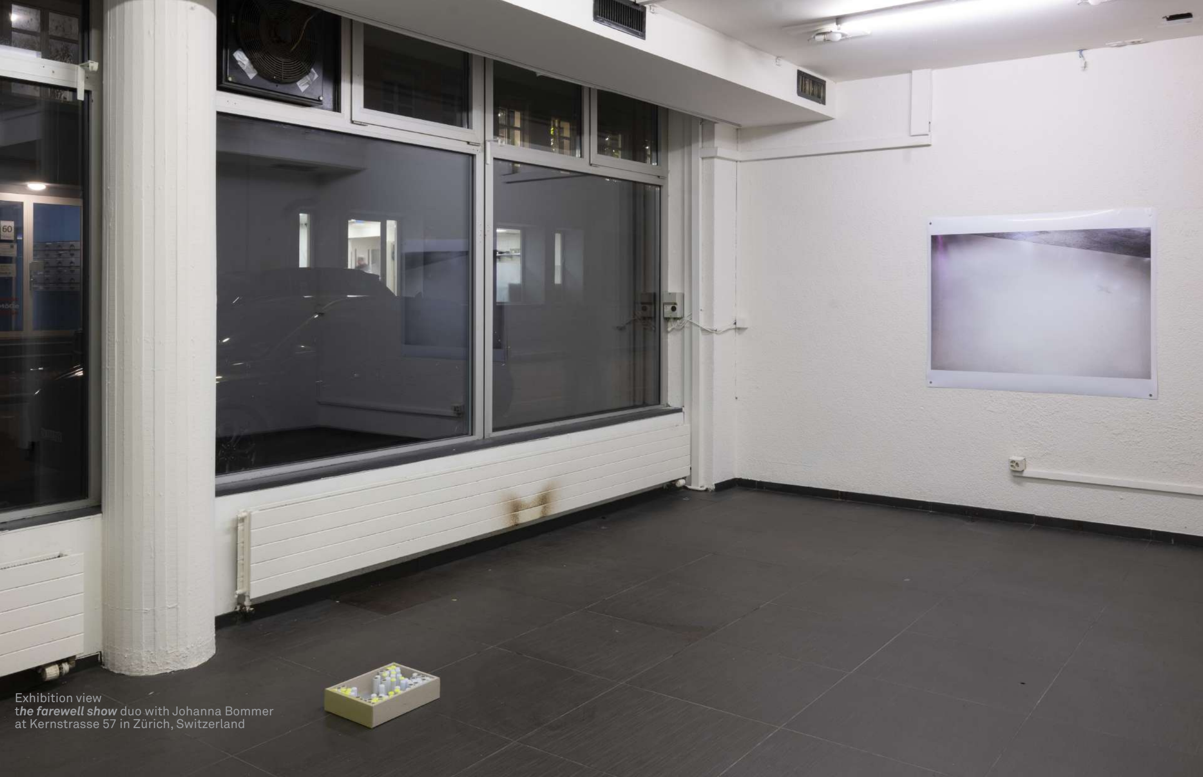
Exhibition view the farewell show duo with Johanna Bommer at Kernstrasse 57 in Zürich, Switzerland