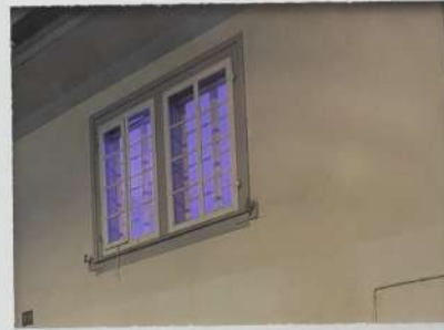
untitled (window 2, Johanna) , 2025 screenboard, inkjet print on semigloss paper, nylon thread 755 × 595 mm