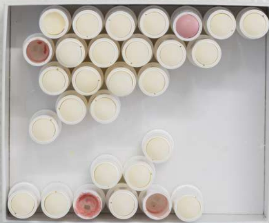
PEARLY SHINE , 2026 sourced cardboard box, base pieces of labello pearly shine and prix garantie lip balms 5.5 × 12.5 × 4.2 cm