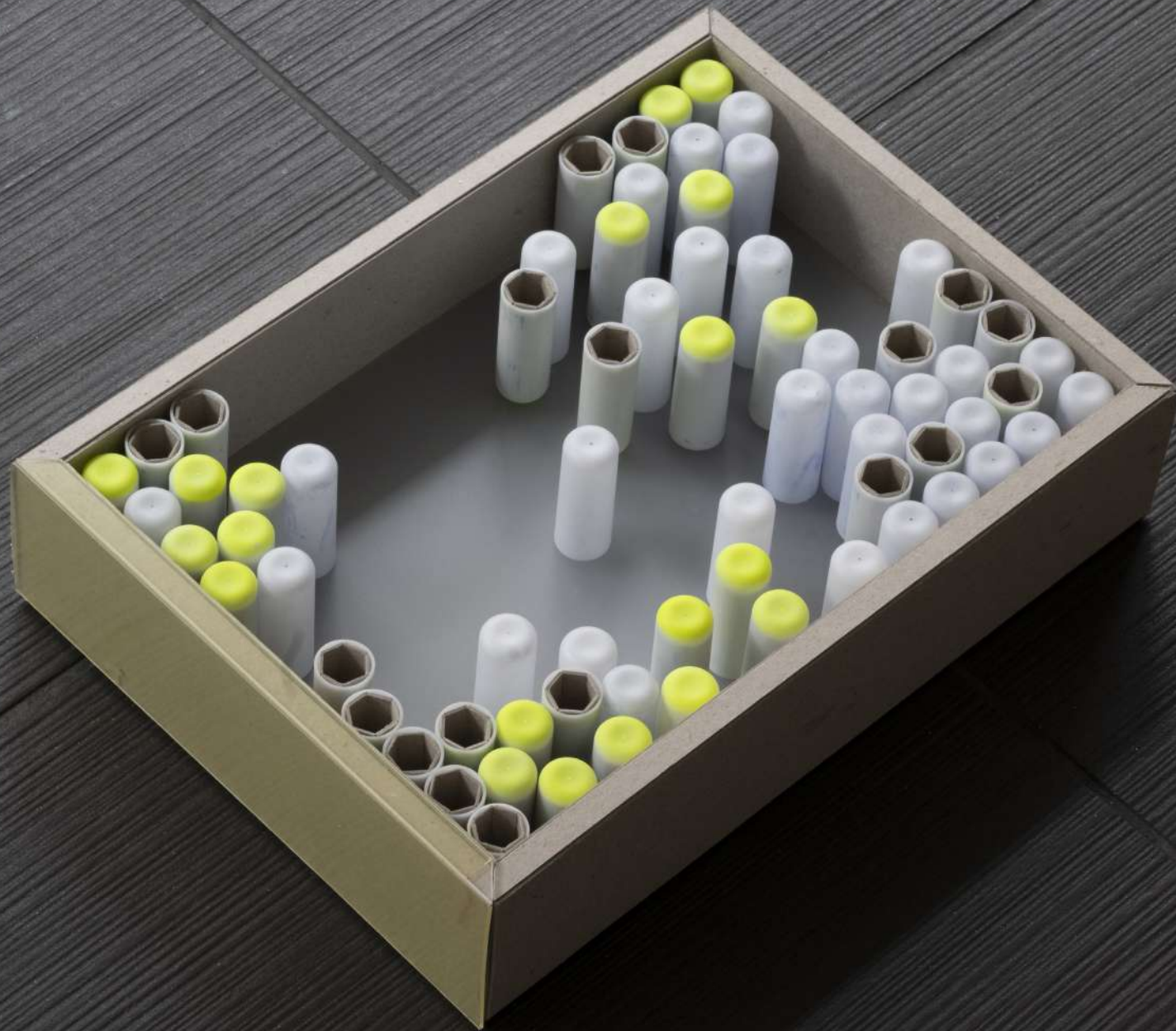
cells no. 3 , 2026 wood encased in cardboard, acrylic glass, cardboard in prix garantie lip balm lids, neon aerosol spray 20 × 25 × 4.8 cm