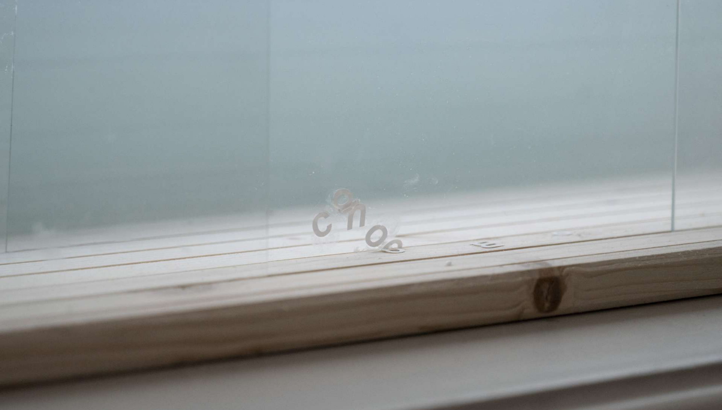
detail of careful carefull , 2025 lipbalm on sourced glass, vinyl letters, tape, wood 30 × 105 × 20 cm