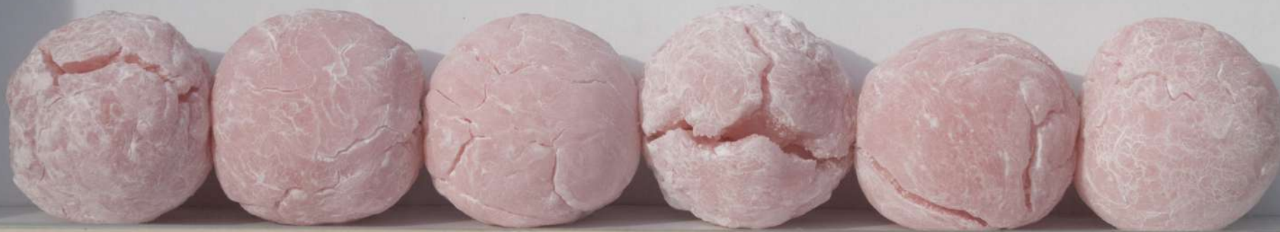
FaceTime (window 9, Enora) , 2025 screenboard, inkjet print on semigloss paper, potato starch beads 59.5 x 75.5 cm, Ø 8 cm