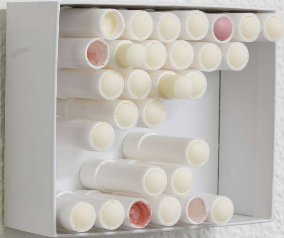
side view of PEARLY SHINE , 2026 sourced cardboard box, base pieces of labello pearly shine and prix garantie lip balms 5.5 × 12.5 × 4.2 cm