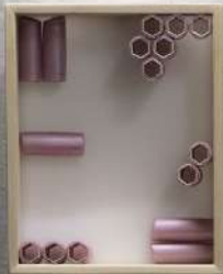
Exhibition view the farewell show duo with Johanna Bommer at Kernstrasse 57 in Zürich, Switzerland