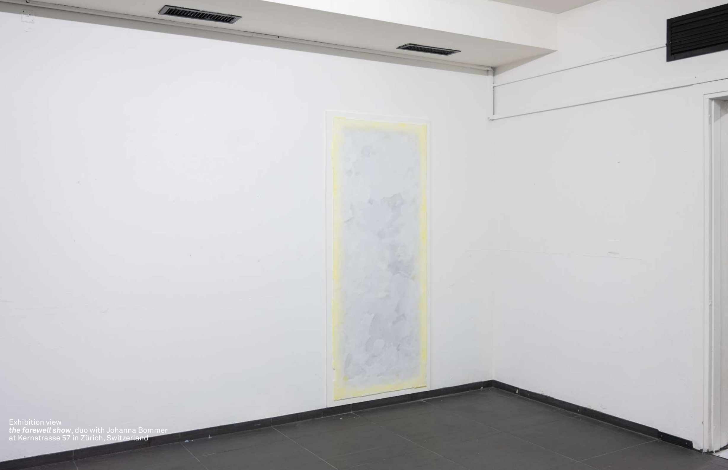
Exhibition view the farewell show , duo with Johanna Bommer at Kernstrasse 57 in Zürich, Switzerland