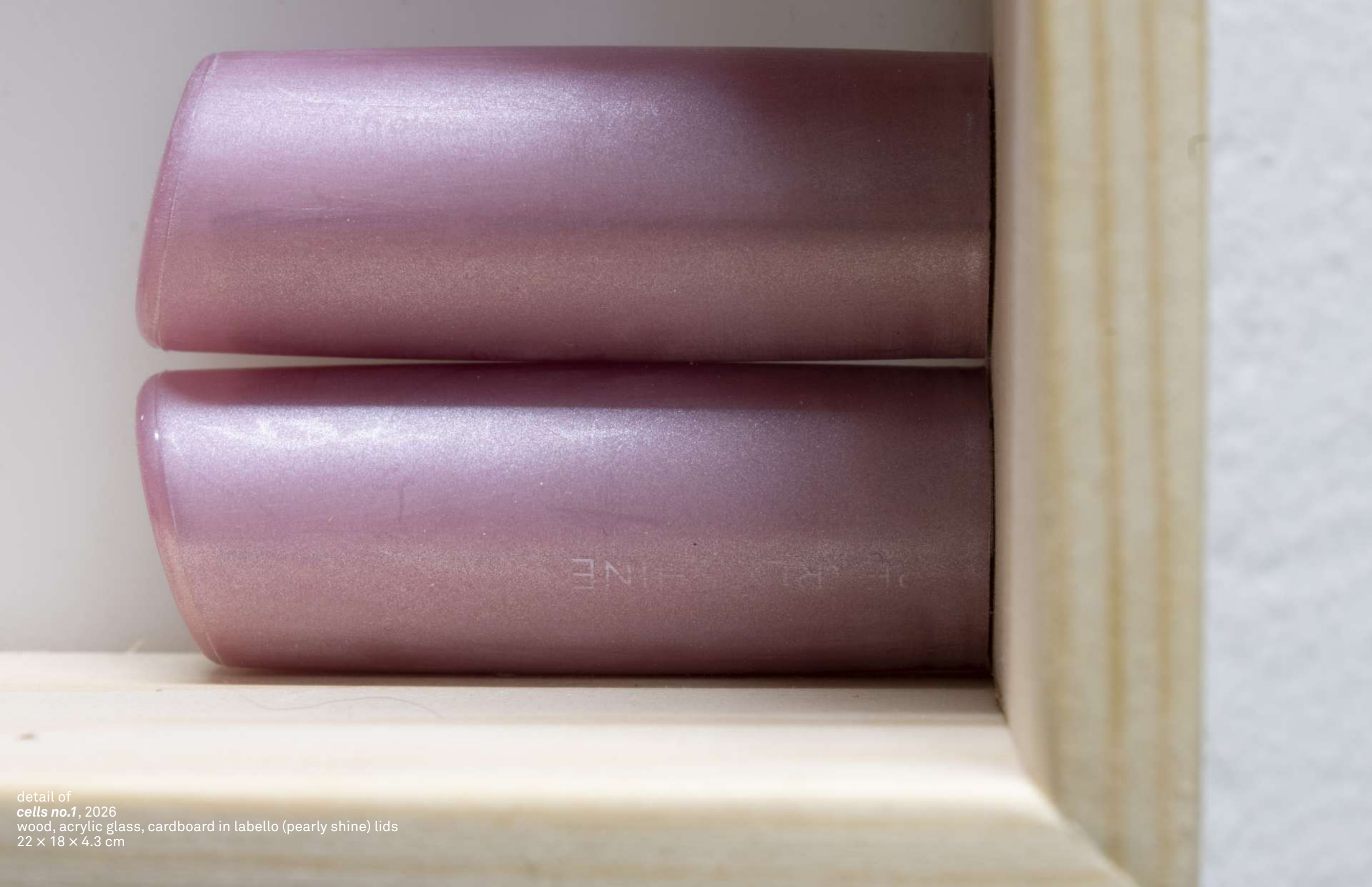
detail of cells no.1 , 2026 wood, acrylic glass, cardboard in labello (pearly shine) lids 22 x 18 x 4.3 cm