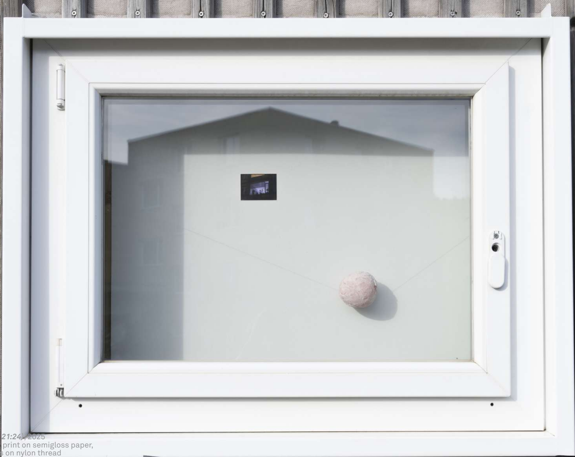
untitled (window 6, 21:24), 2025 screenboard, inkjet print on semigloss paper, potato starch balls on nylon thread 59.5 x 75.5 x 11.8 cm