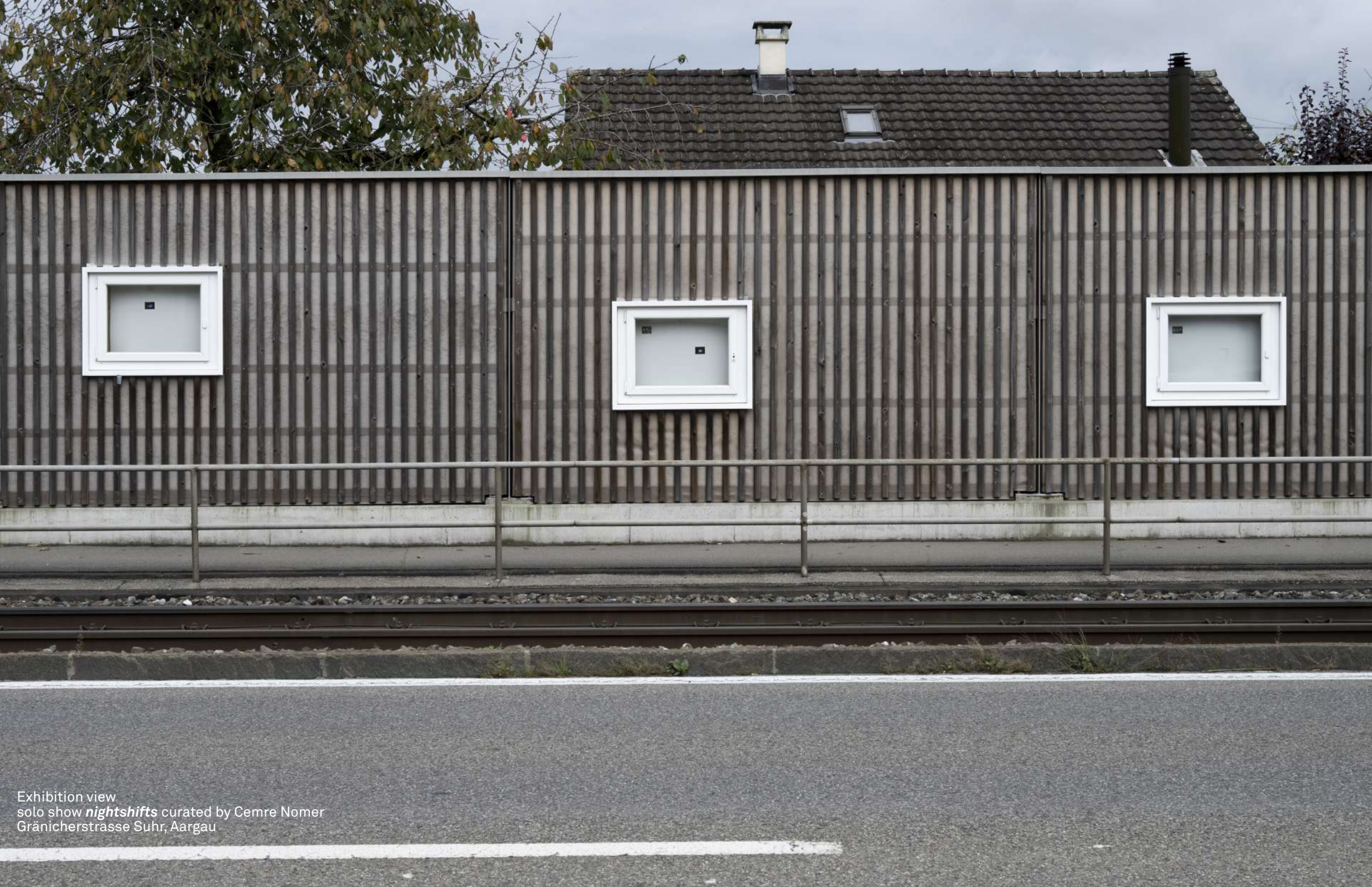
Exhibition view solo show nightshifts curated by Cemre Nomer Gränicherstrasse Suhr, Aargau