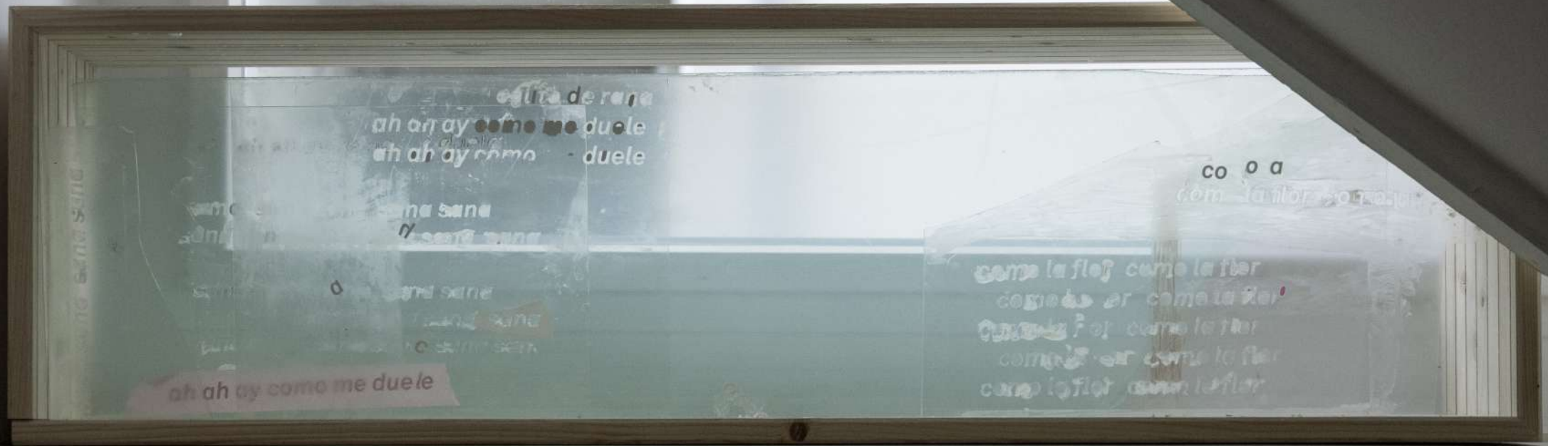
Exhibition view group show You All 5G curated by Moritz Furger at Studio E4 in Zürich, Switzerland