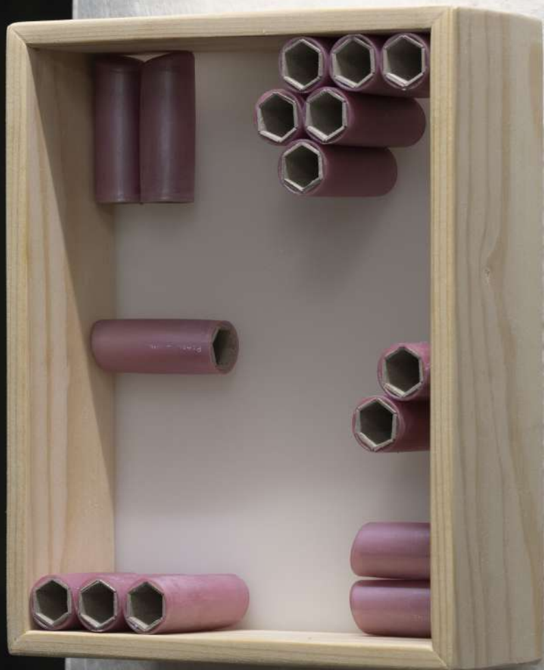
cells no.1 , 2026 wood, acrylic glass, cardboard in labello (pearly shine) lids 22 × 18 × 4.3 cm